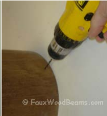
10. Pre-drill the side of your viga tail to accept your screws.