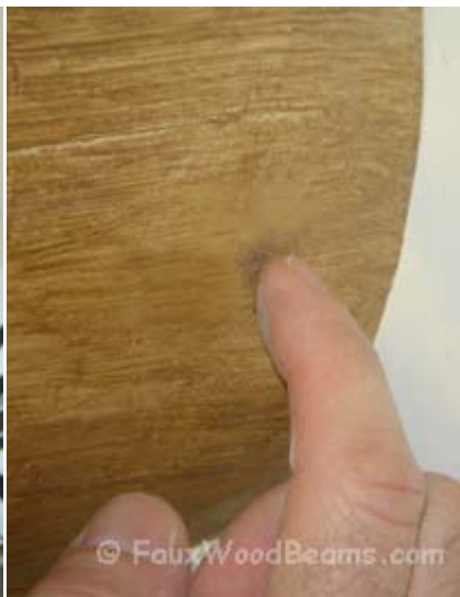
12. Put caulking over the screw heads to hide the screws.