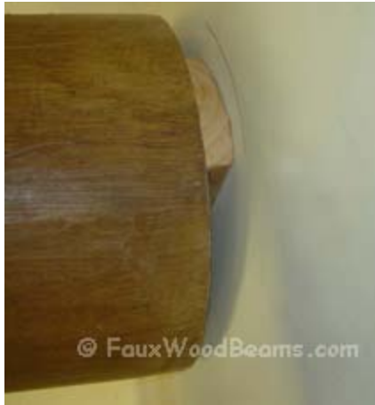
9. Slide the viga tail over the mounting block.