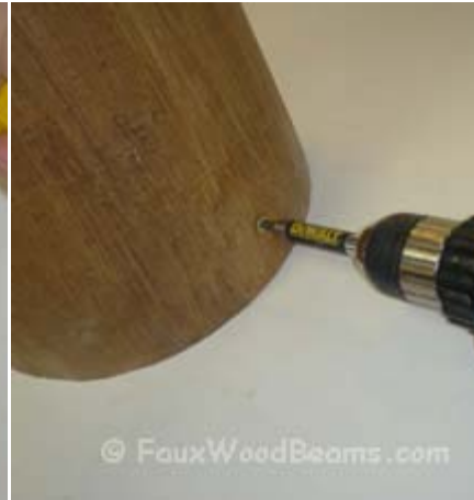
11. Put a screw through the viga tail (on both sides) making sure that the screw penetrates the mounting block.